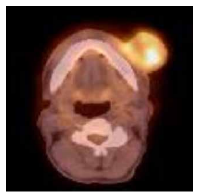
Figure 2. A hypermetabolic mass is present on left buccal area.

The patient was recommended palliative chemotherapy. Palliative surgery was planned to buccal area because of bleeding, disfiguring and obstruction of oral nutrition. However, it could not be performed due to the poor general condition. The patient died because of late stage carcinoma.