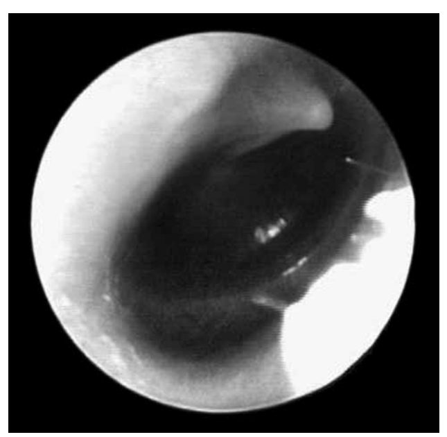
Figure 1. Otitis media with effusion.

and Räisänen<sup>[9]</sup> proposed that accumulation of a sticky glue effusion material in the middle ear cavity might serve as a barrier against ascending pathogens from the nasopharynx.