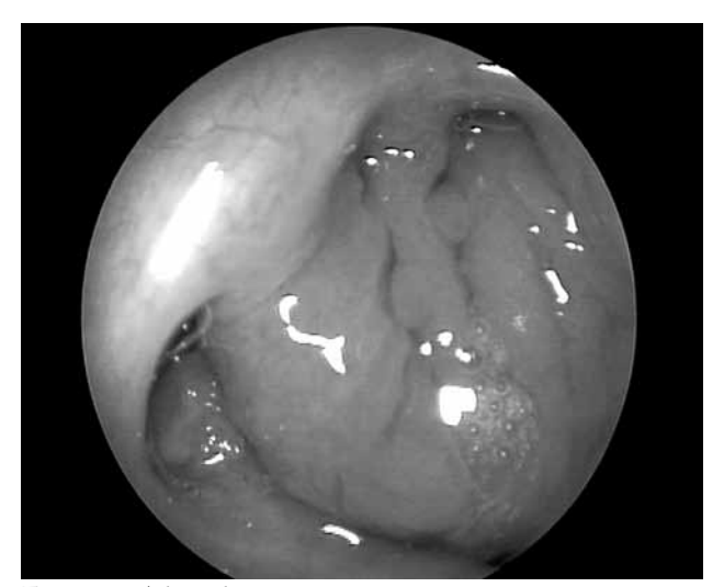
Figure 3. Adenoid tissue.

Moreover, viral or bacterial infections of the upper airway are not only associated with AOM, but also with chronic suppurative otitis media. In the past, nasal obstruction secondary to rhinitis, deviated septum, polyps and sinusitis were associated with OME.<sup>[13]</sup> In this study, the Toynbee phenomenon may be responsible